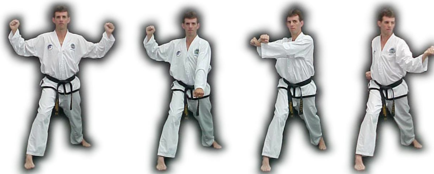
Inner forearm circular block broken down into 4 parts